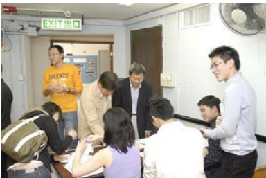
Mentors & mentees at reception...

The mentees found that the sharing was very inspiring and useful and it was a golden opportunity to meet with professionals from over 10 industries in one occasion.