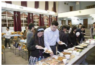
Time for dinner...