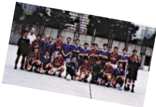
Grand Sport (WYCHK 78) and 串B (WYK)