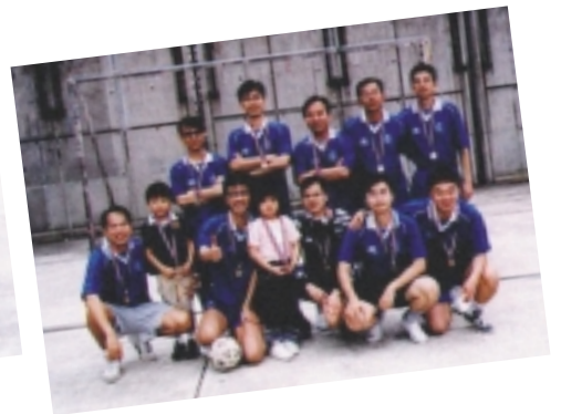
串B (WYK) 2nd runner-up