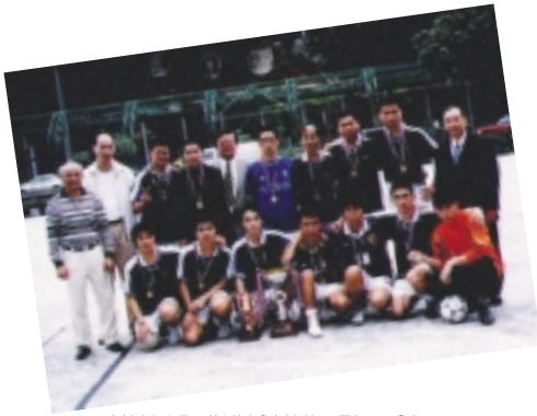
HK96B (WYCHK): The Champion