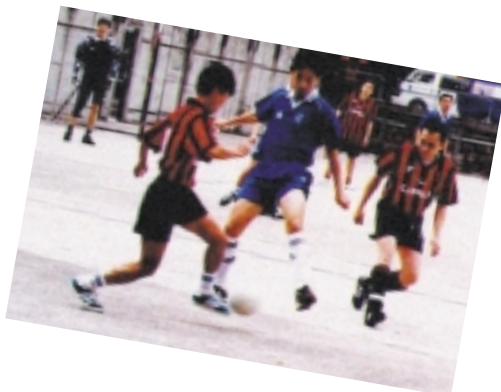
Watch my leg, I am 20 years your senior