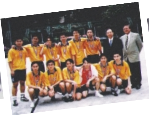
ZBFC-R(WYK) 1st runner-up