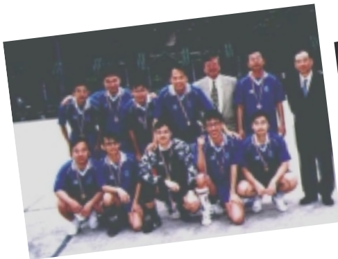
串B (WYK) 2nd runner-up