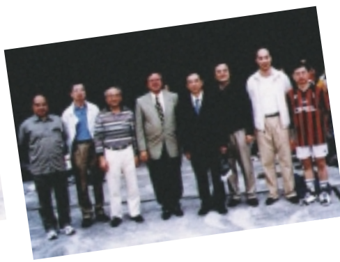
The Organizing Committee