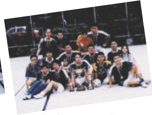
The Champion and Friends