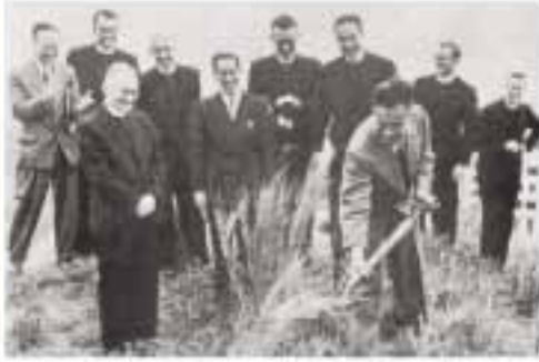
1953: Ground Breaking Ceremony on Mount Parish