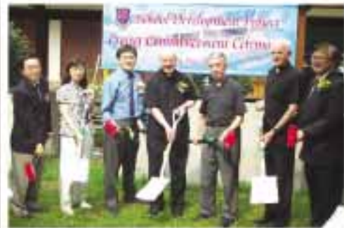
2003: Project Commencement Ceremony on 25 May