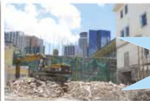
Progress photo - 2 Jul 2003: Gone is the music room!

For List of Donors and latest SDP News, visit Wah Yan College (H.K.) website at www.wahyan.edu.hk or Wah Yan (H.K.) Past Students Association website at www.wahyan-psa.org