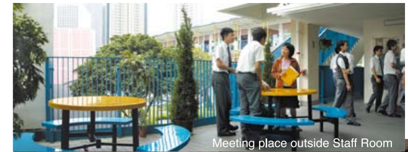
Meeting place outside Staff Room