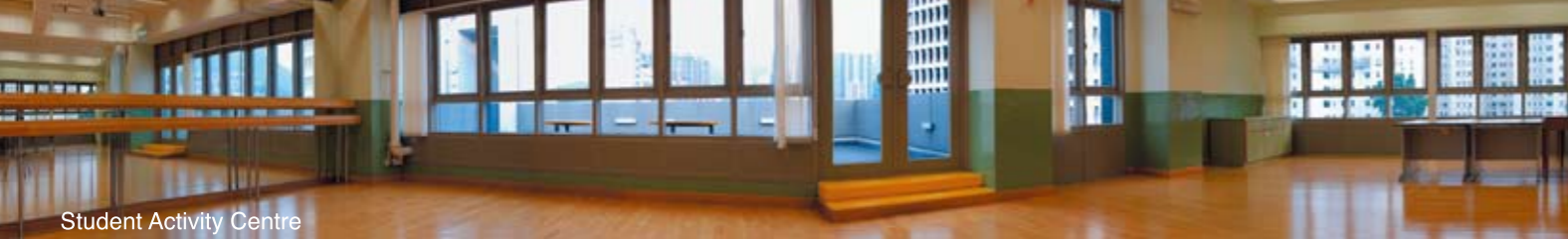
Student Activity Centre